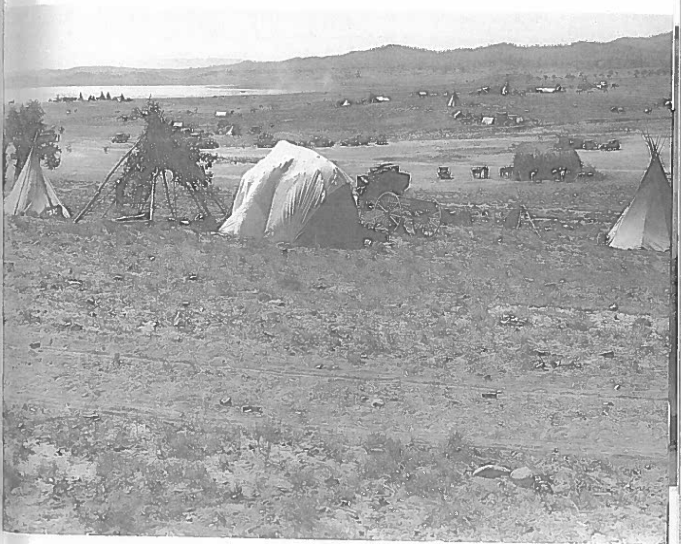
Jicarilla Apache camp, circa 1935. The modern Jicarilla formed from two bands: the Ollero ("pot makers") brought Pueblo traits from their neighbors at Picuris, Pecos, and Taos; the Llanero ("plainsmen") brought traits from the Plains tribes — tipis, travois, parfleches.

Vigil went on: "The person that originated that probably got it from some lady that didn't speak Spanish. 'Xicarilla' had something to do with chocolate [in fact, in Mexico, jicara is a calabash-tree gourd with chocolate or other liquids in it]; our pitched baskets and micaceous pots looked sort of like chocolate. And so I think Jicarilla means something like 'chocolate pot, chocolate basket.' But that doesn't stop us from making 'little baskets' to sell to the tourists who ask for them!"